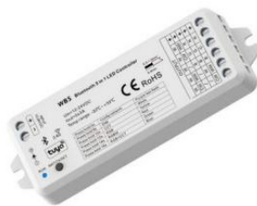
SMART 5 IN 1 CONTROLLER