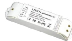
RGBCW DALI CONTROLLER